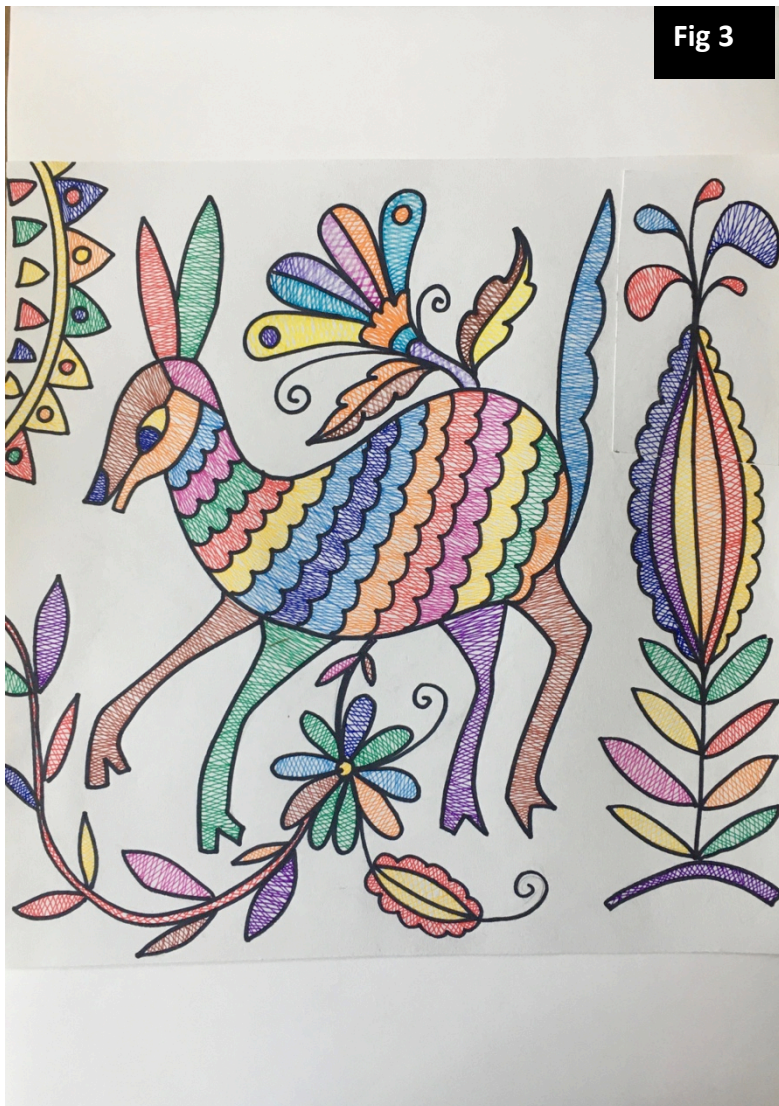
Fig 3 shows my design in my sketchbook filled in using the herringbone pattern.

The stitch that is used in Otomi embroidery is called a herringbone stitch, we can recreate the herringbone stitch pattern with felt tips to colour in our designs.